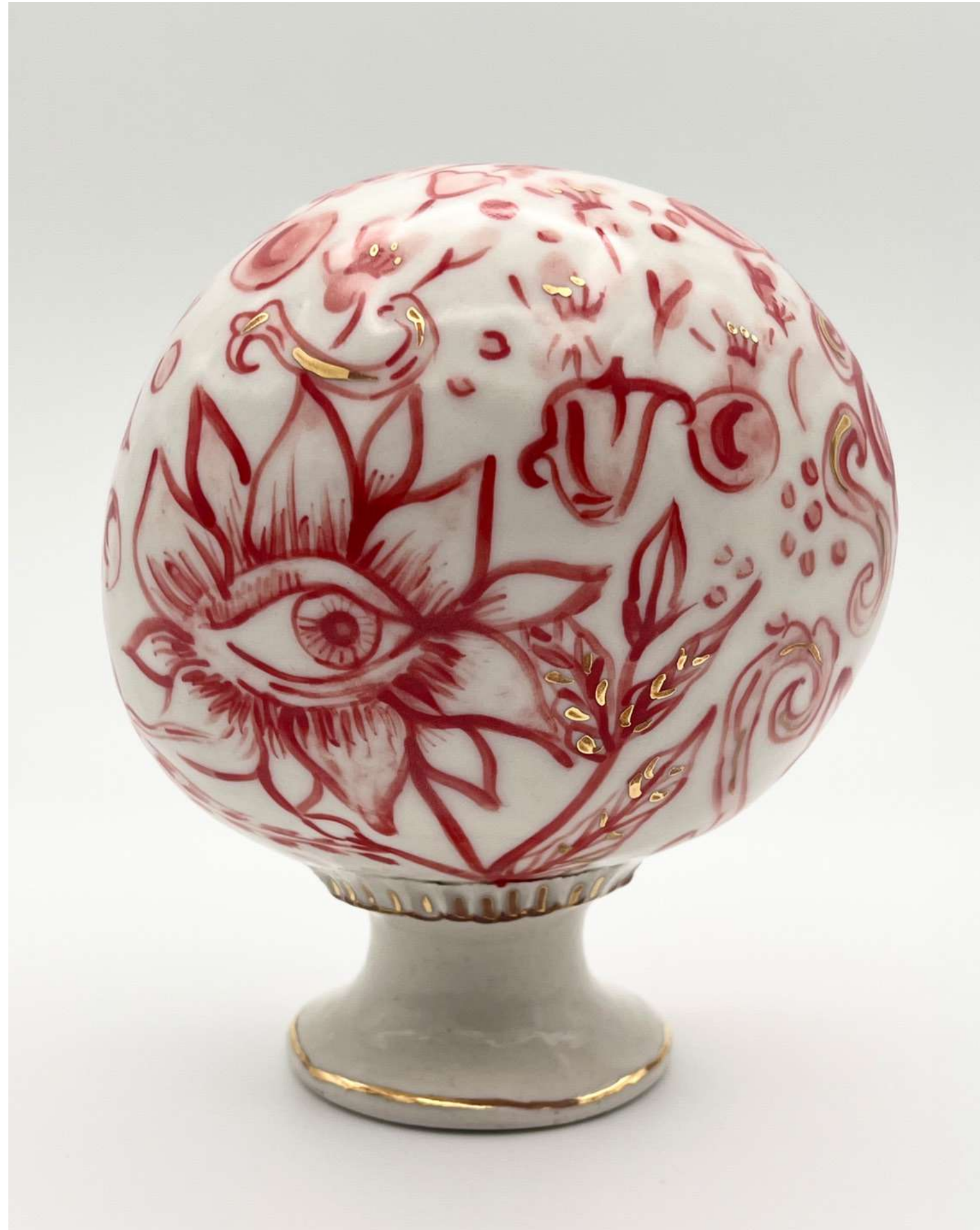
Le deuxième sexe Porcelain, underglaze, lustre