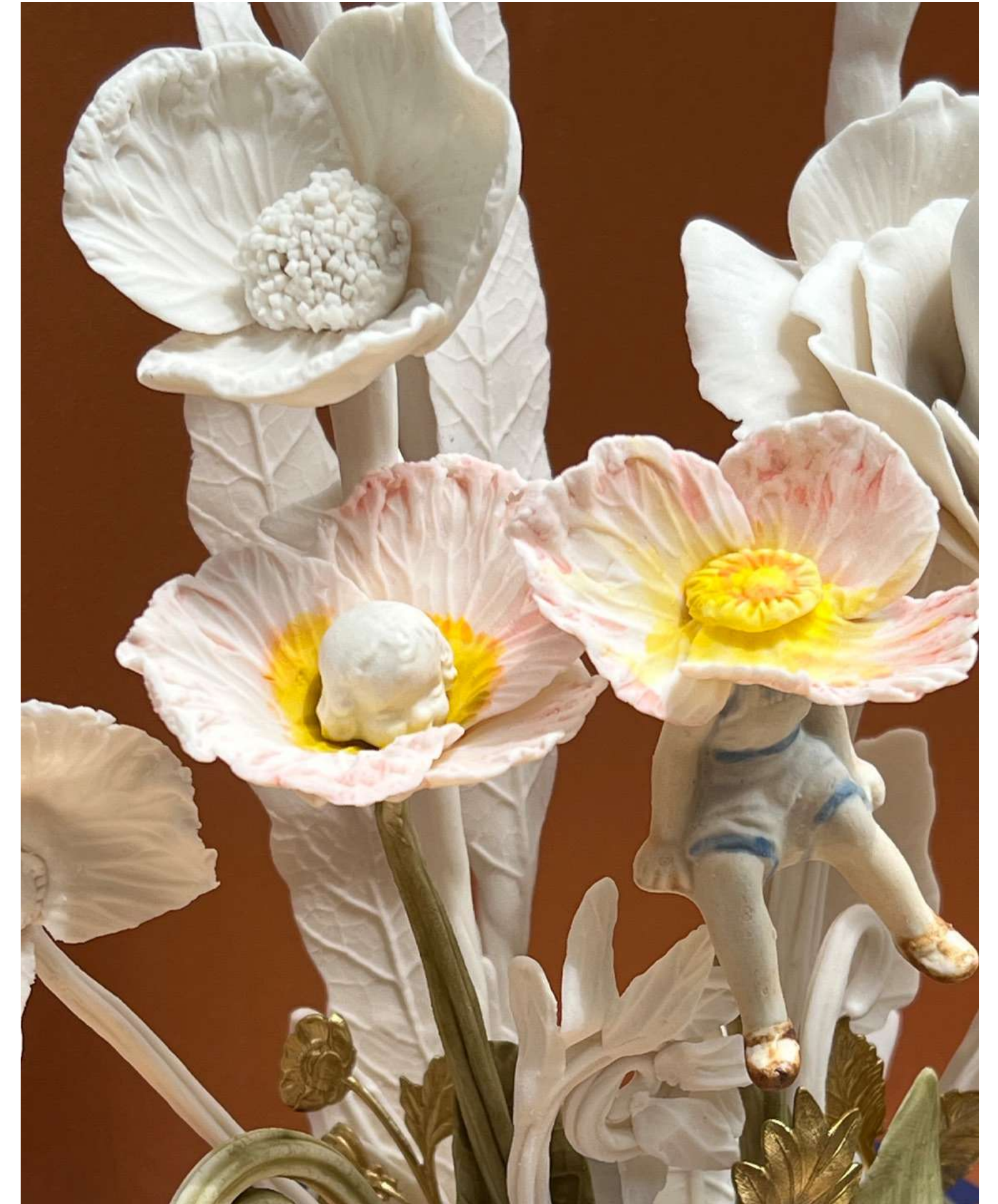
Playful Porcelain, watercolour underglaze, Wedgwood China