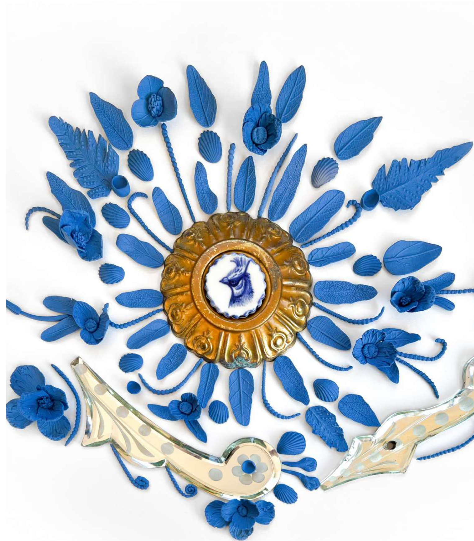
Indigo Blue porcelain, brass, venetian mirror