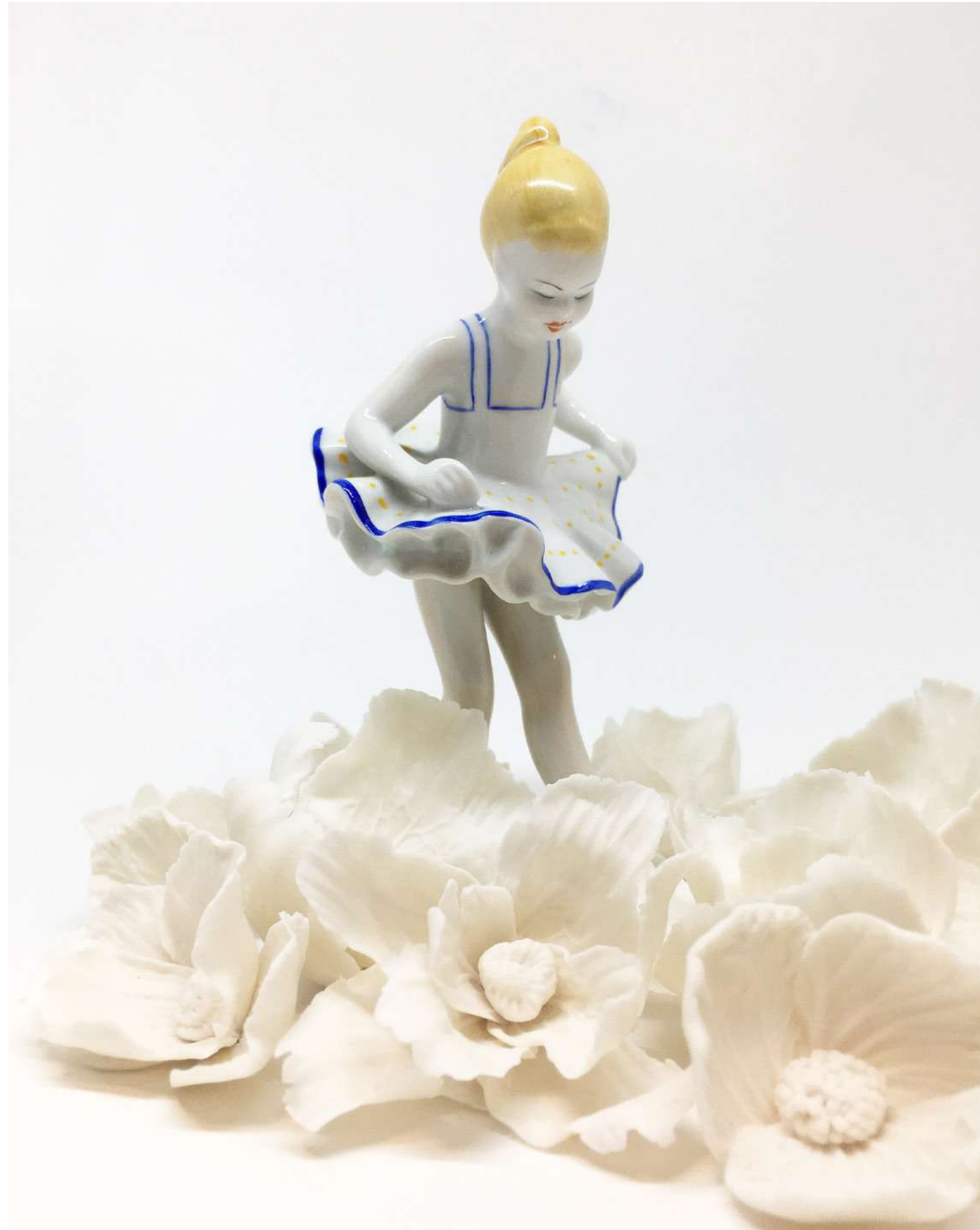
Ballet Porcelain, antique doll