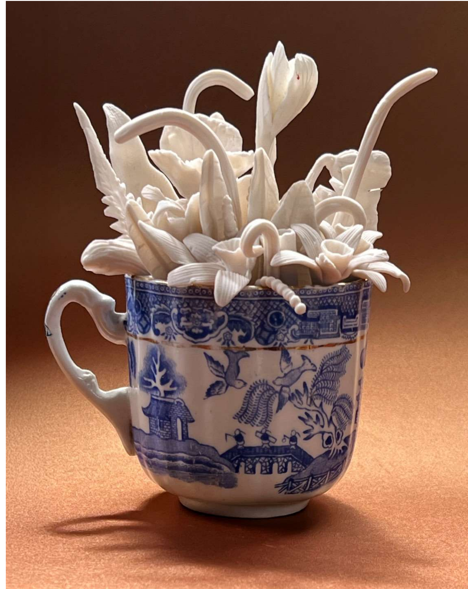
High Tea Porcelain, antique tea cup