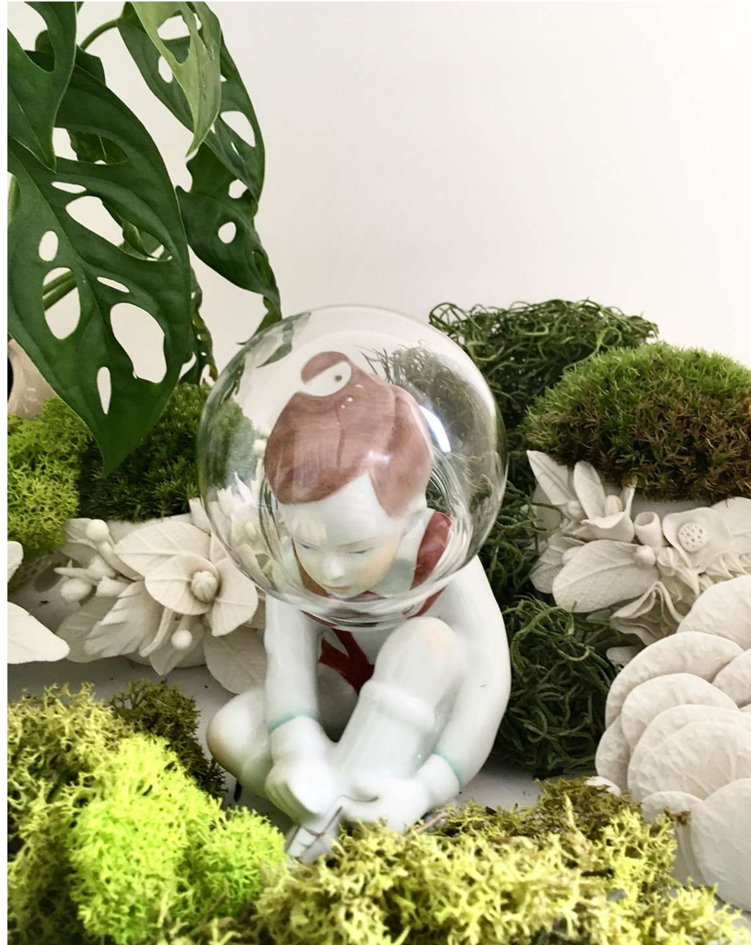
Self-Isolation Porcelain, handblown glass