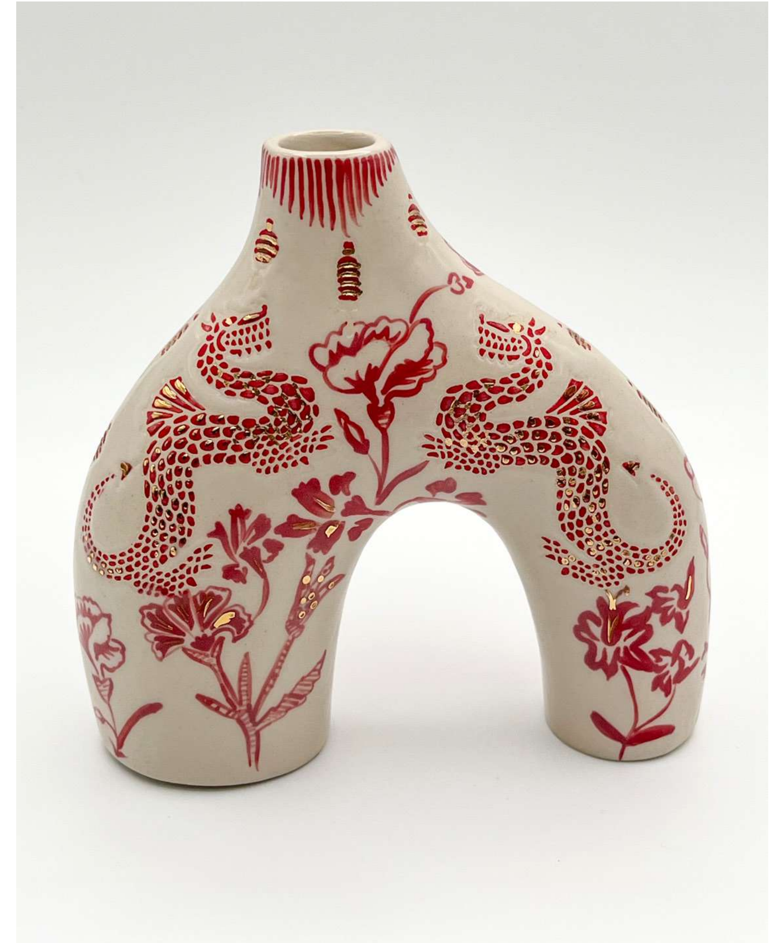
Flora and the Dragons Porcelain, underglaze, lustre