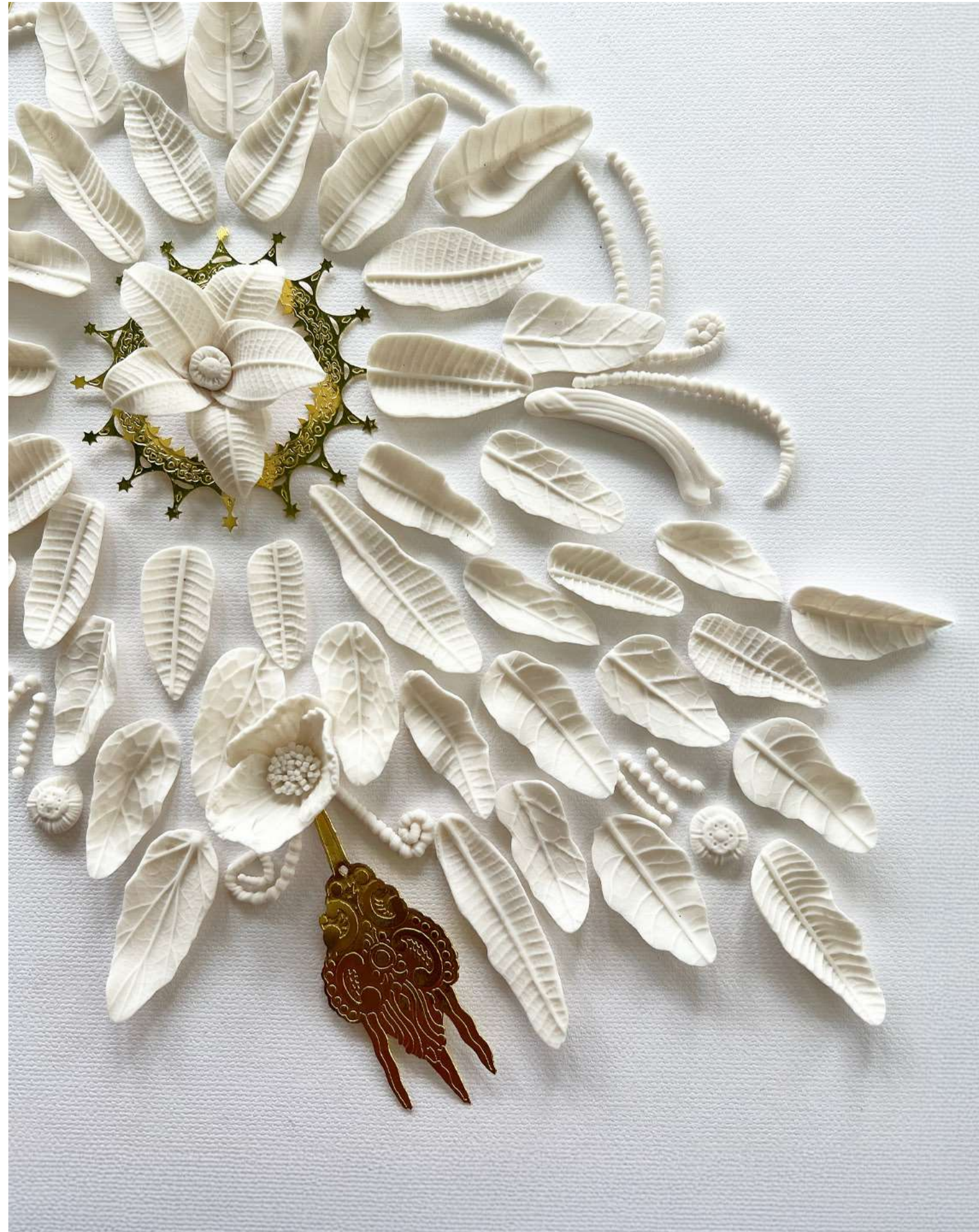
Sagrado Corazón Porcelain, brass