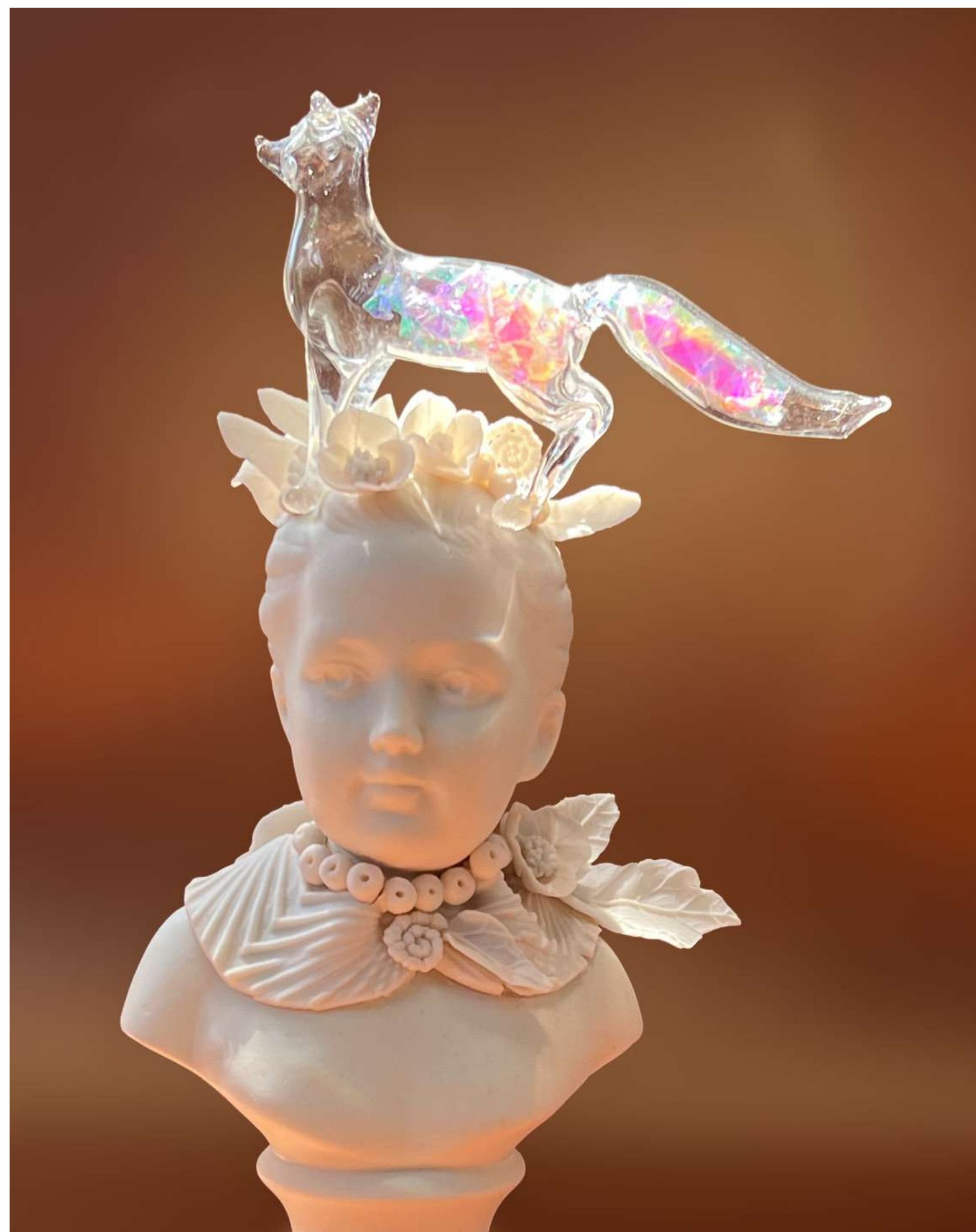
Women with Wolves Porcelain, handblown glass