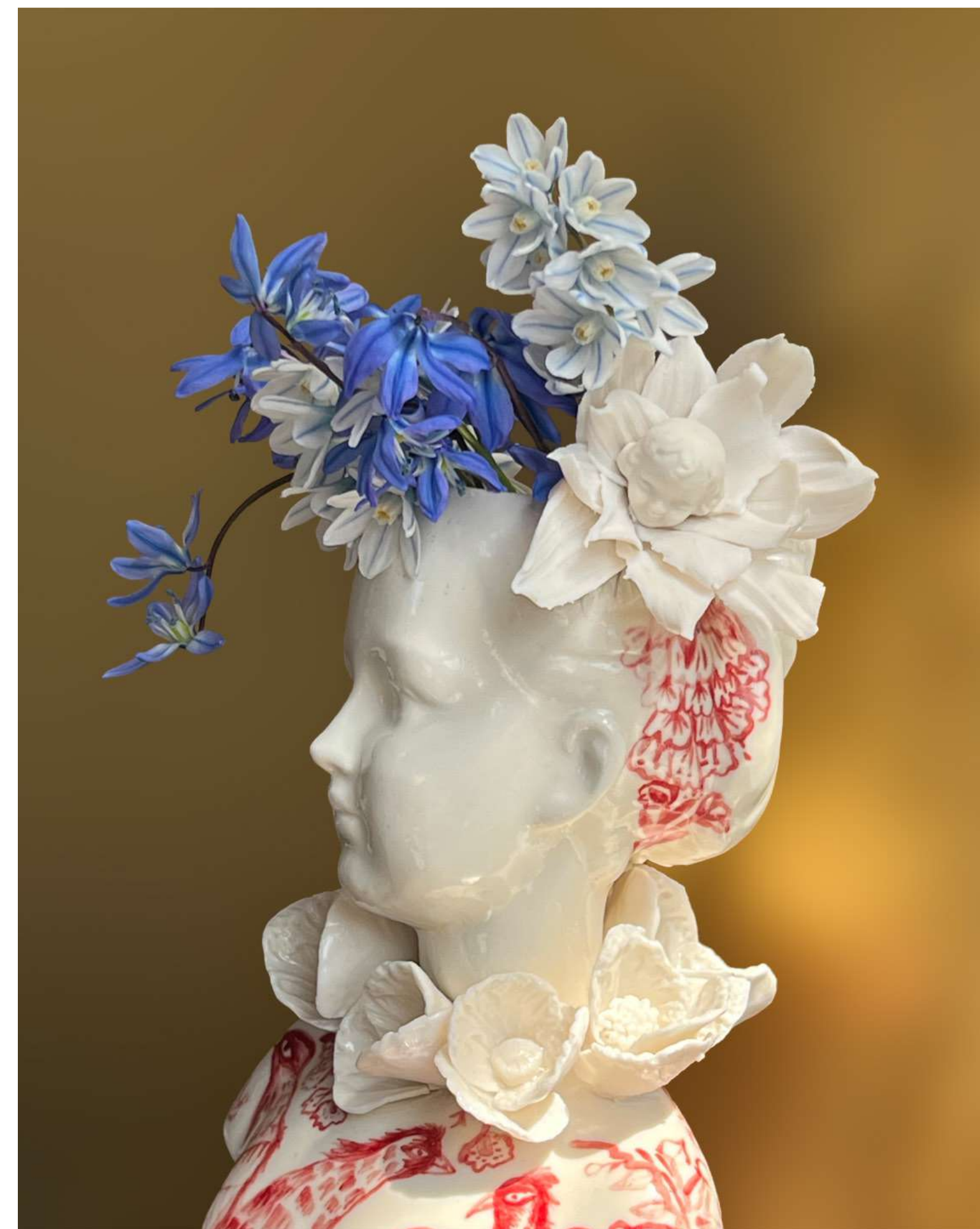
Red Thread Porcelain, brass watercolour underglaze