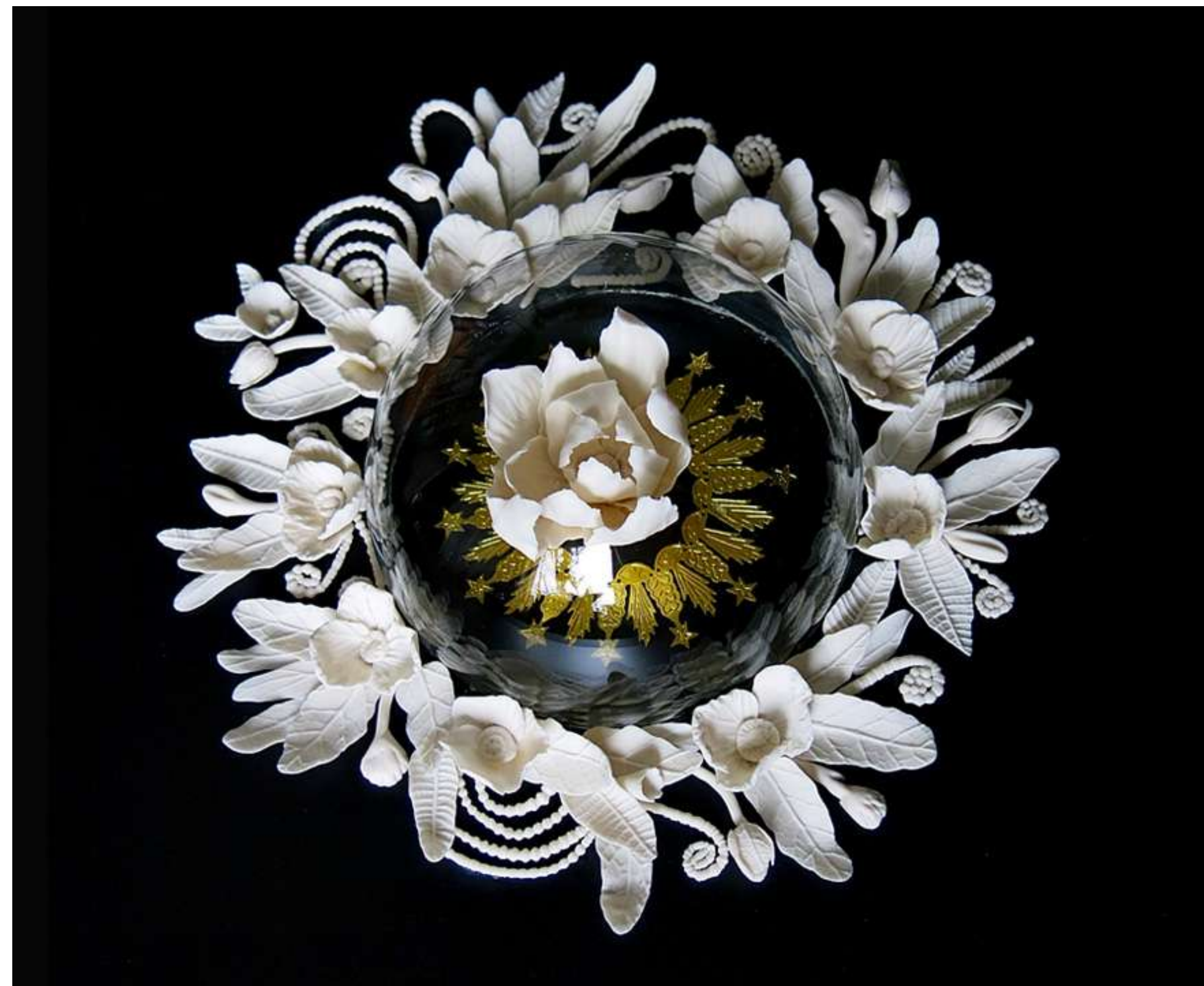
Páramo Porcelain, glass, brass