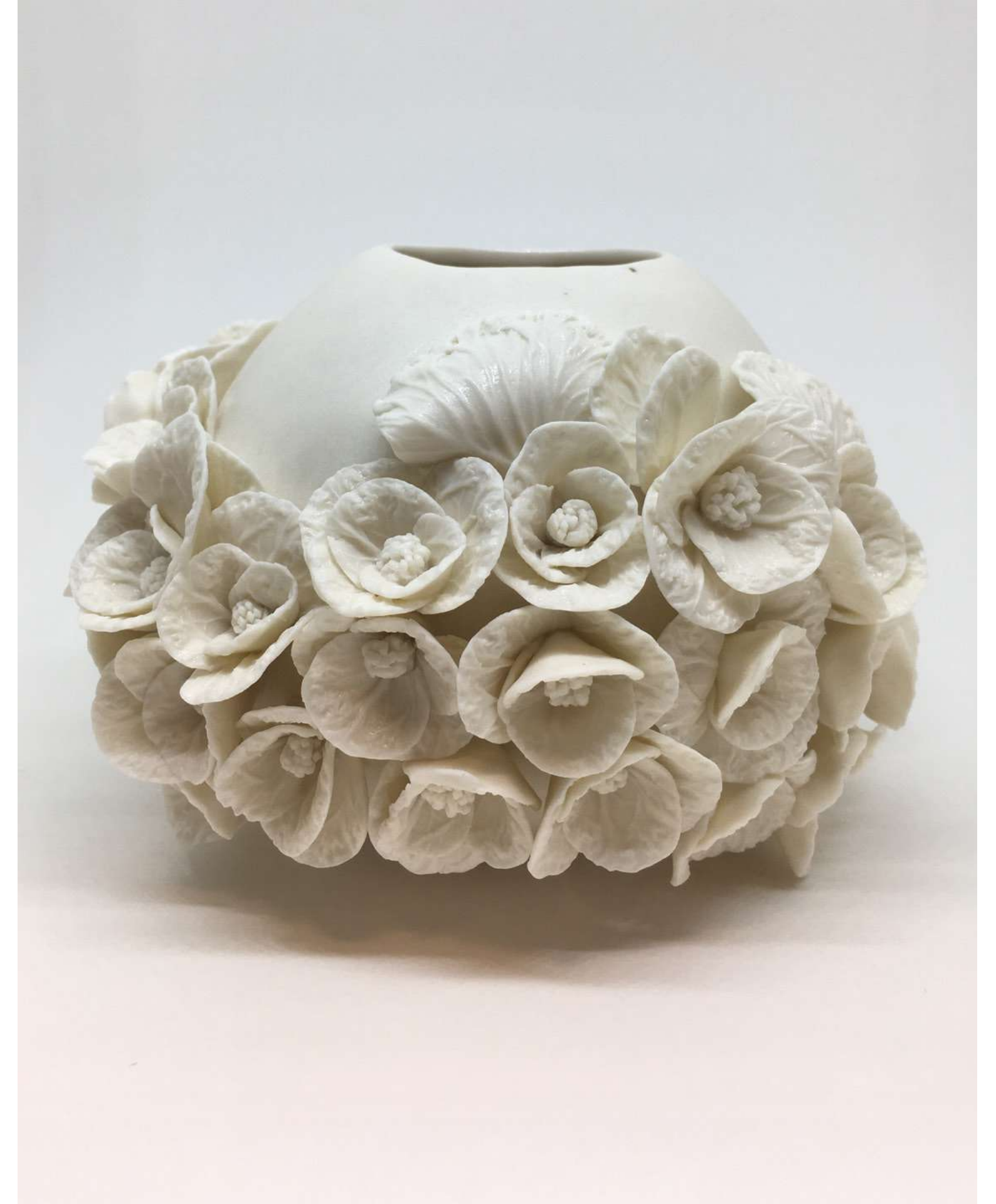
Resilience Porcelain, clear glaze