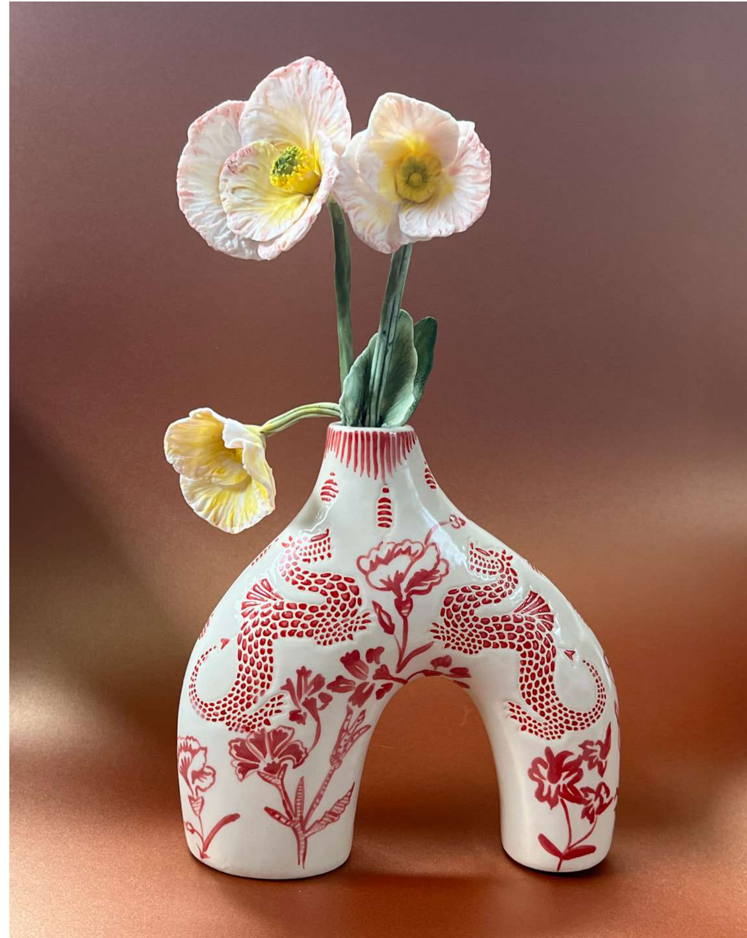
Flora and the Dragons Porcelain, watercolour underglaze