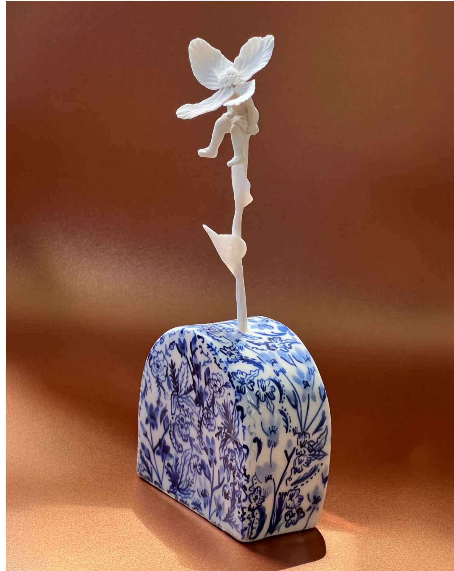
Hibiscus Girl Porcelain, brass, watercolour underglaze