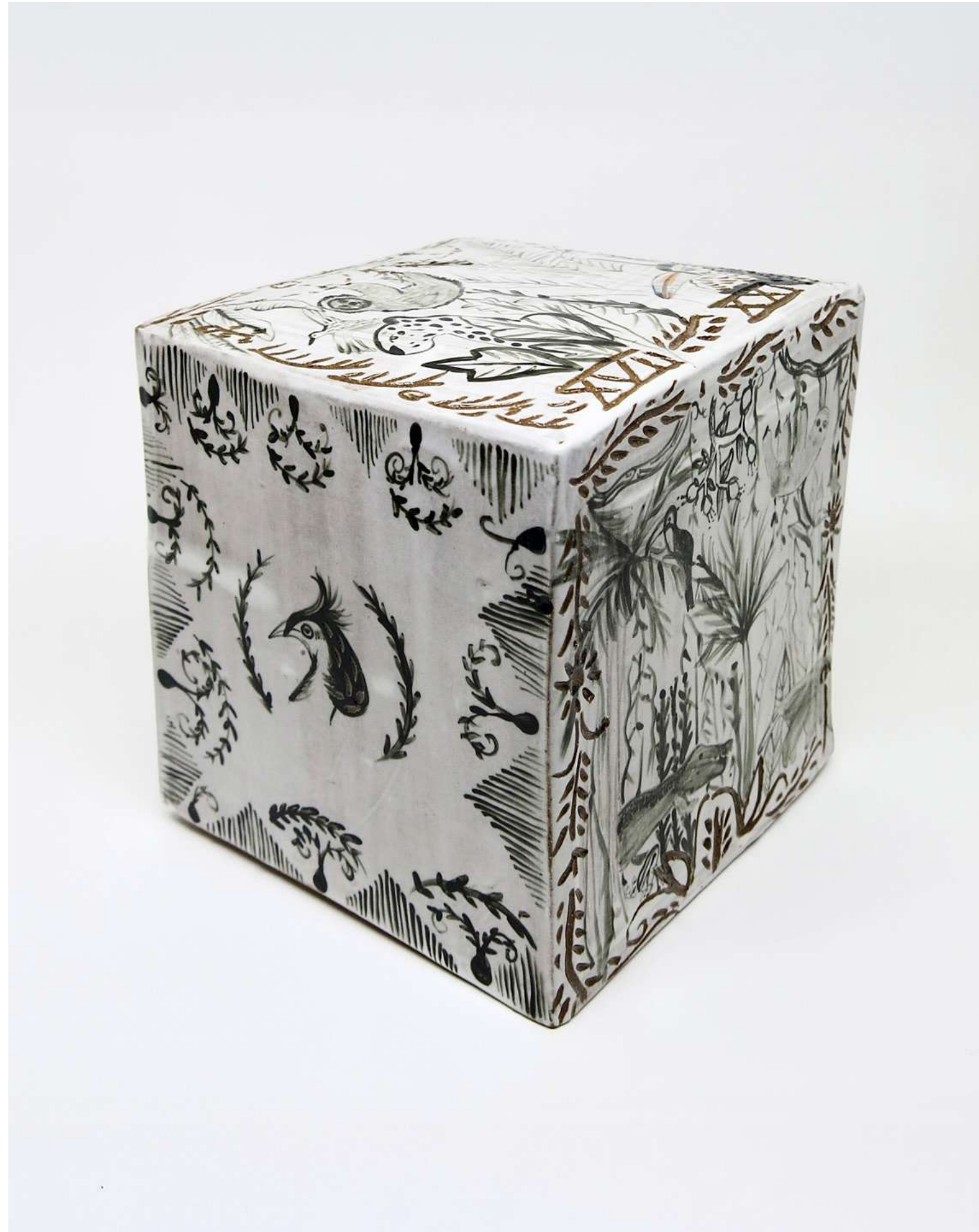
Pandora's Box Brown clay, engobe