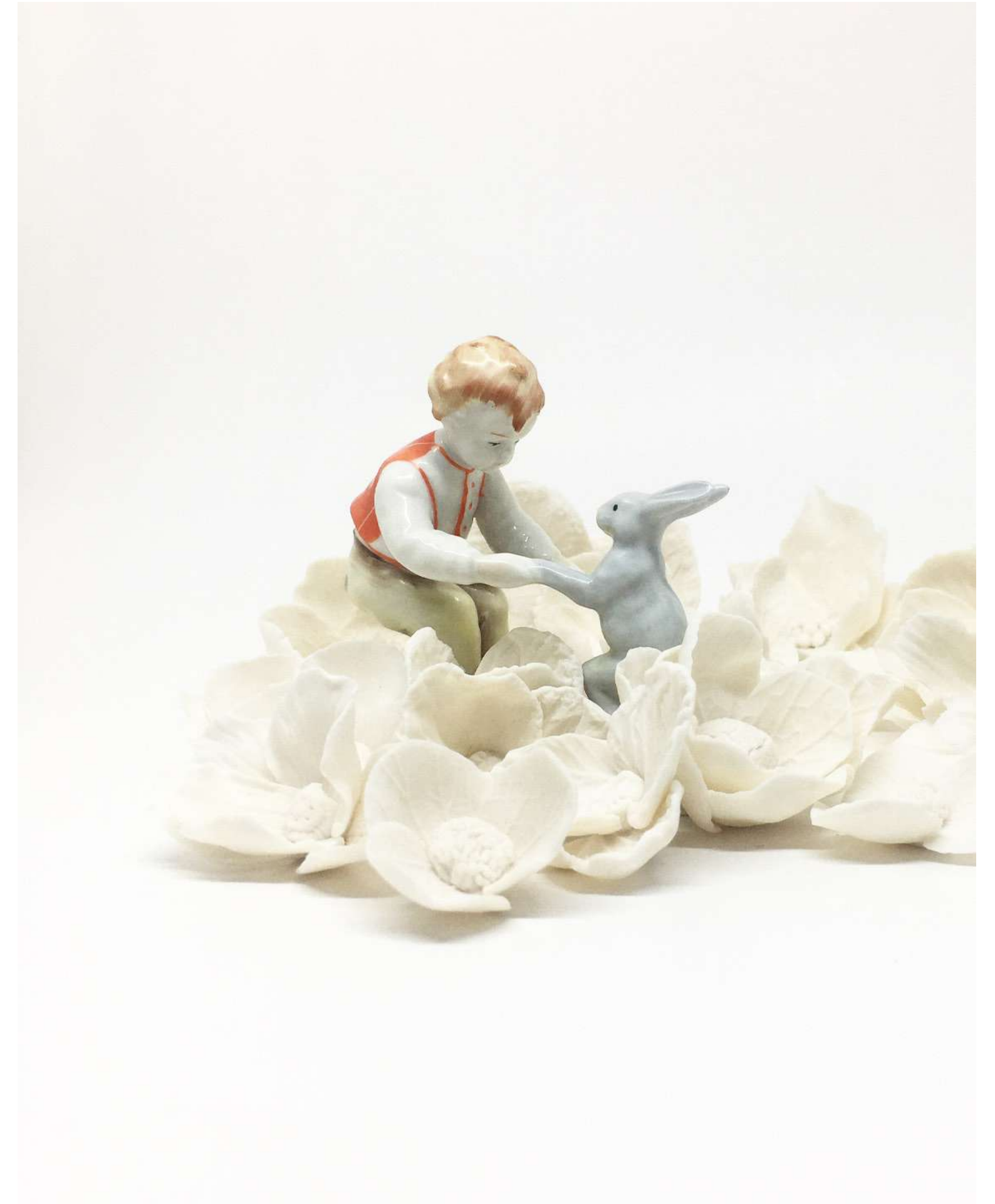
Boy and Rabbit Porcelain, antique doll