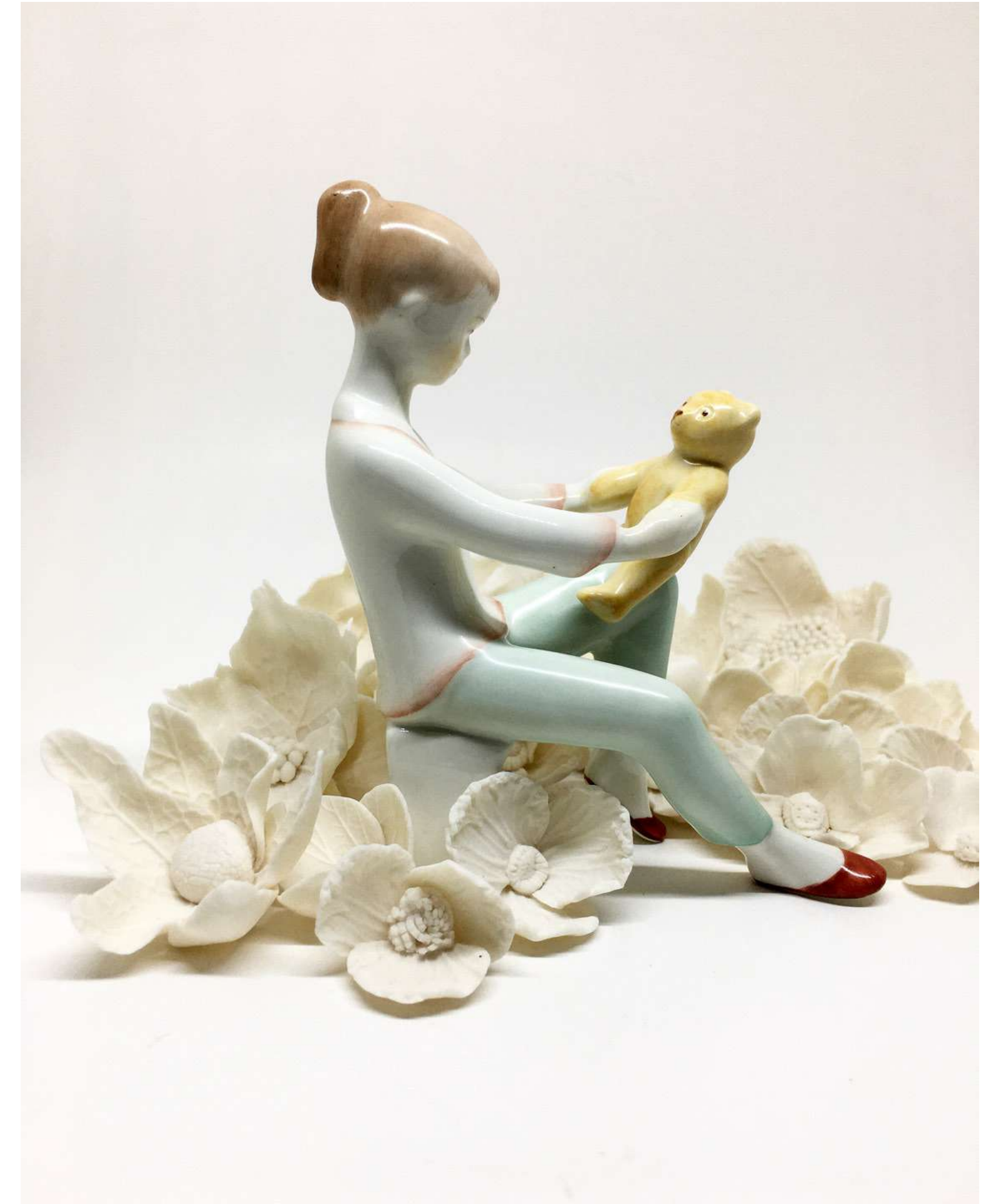
Self-Isolation Bear Porcelain, antique doll