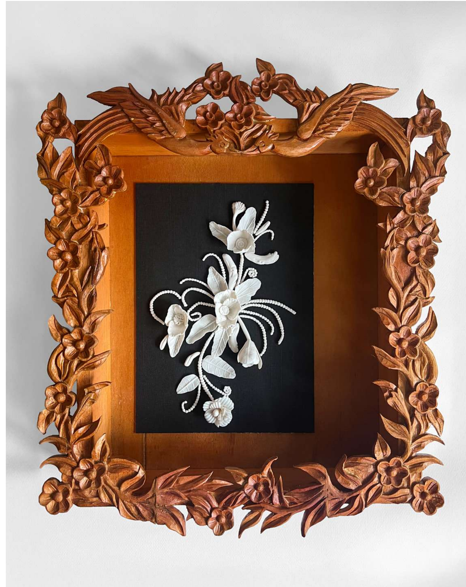
Zambrano Porcelain, carved wood