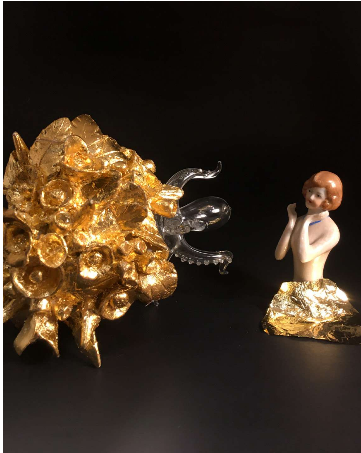
Frenesí Clay Handblown glass, antique doll