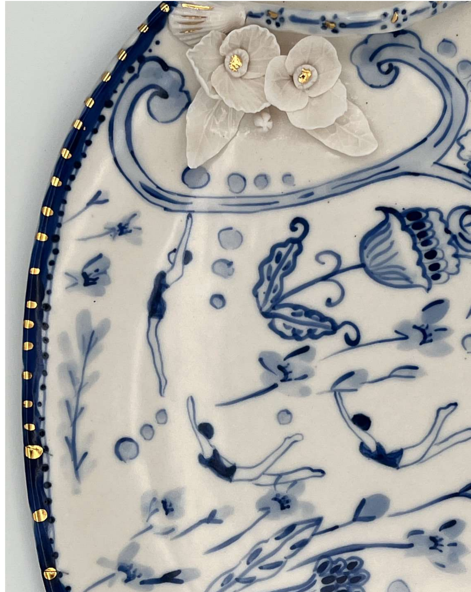
Ederle Porcelain, underglaze, lustre