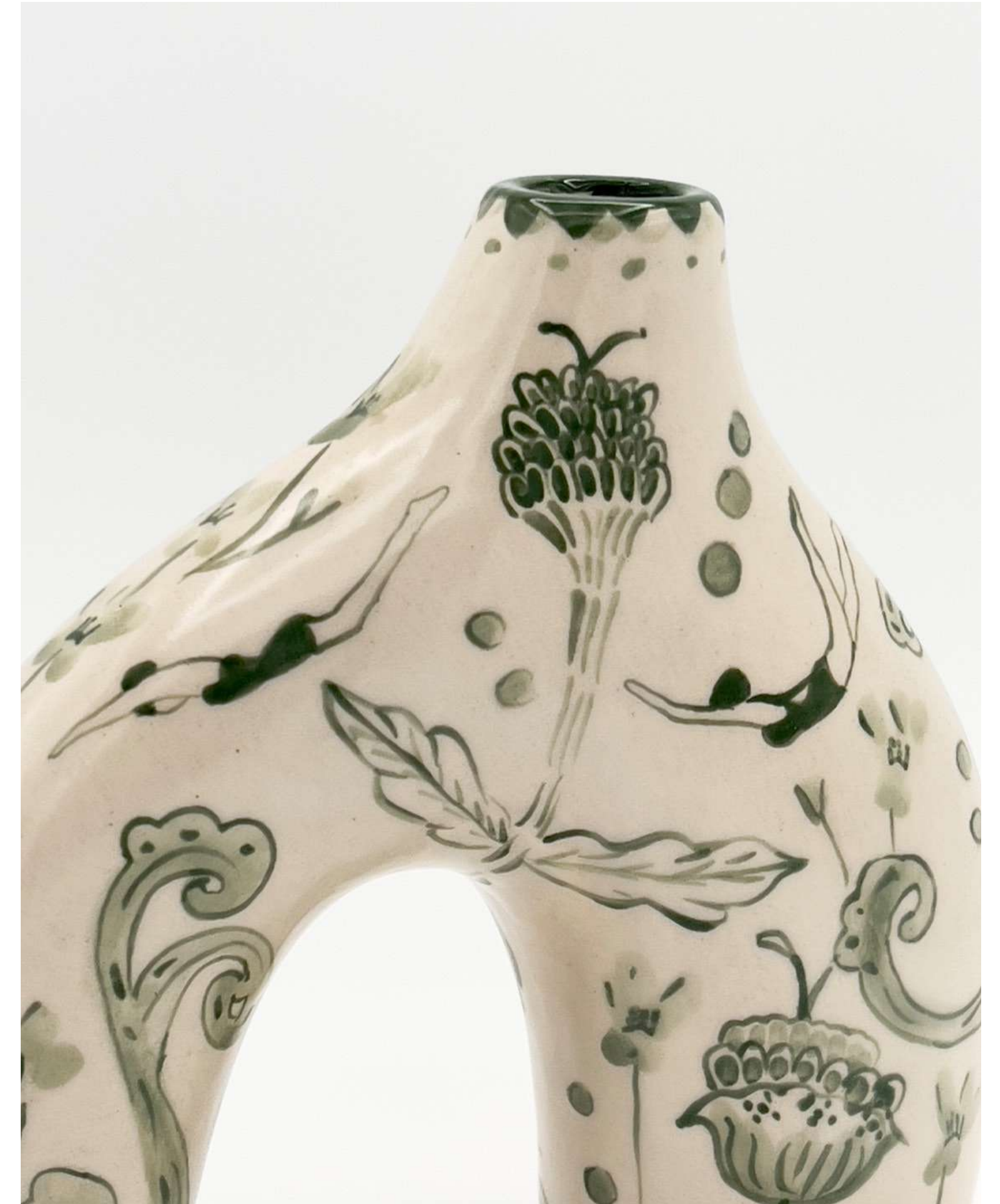
Flora Porcelain, watercolour underglaze