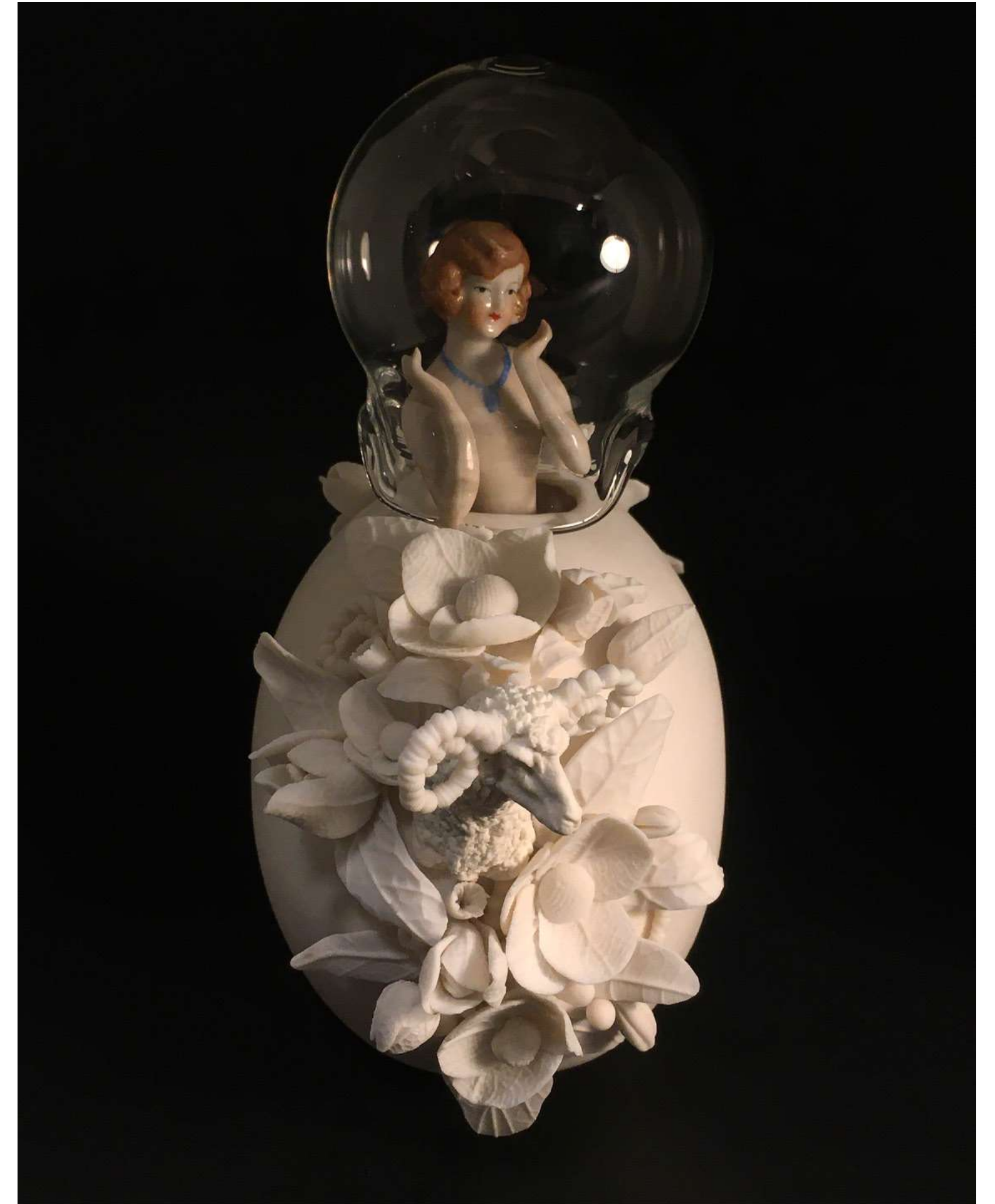
Frenesí Porcelain, handblown glass, antique doll