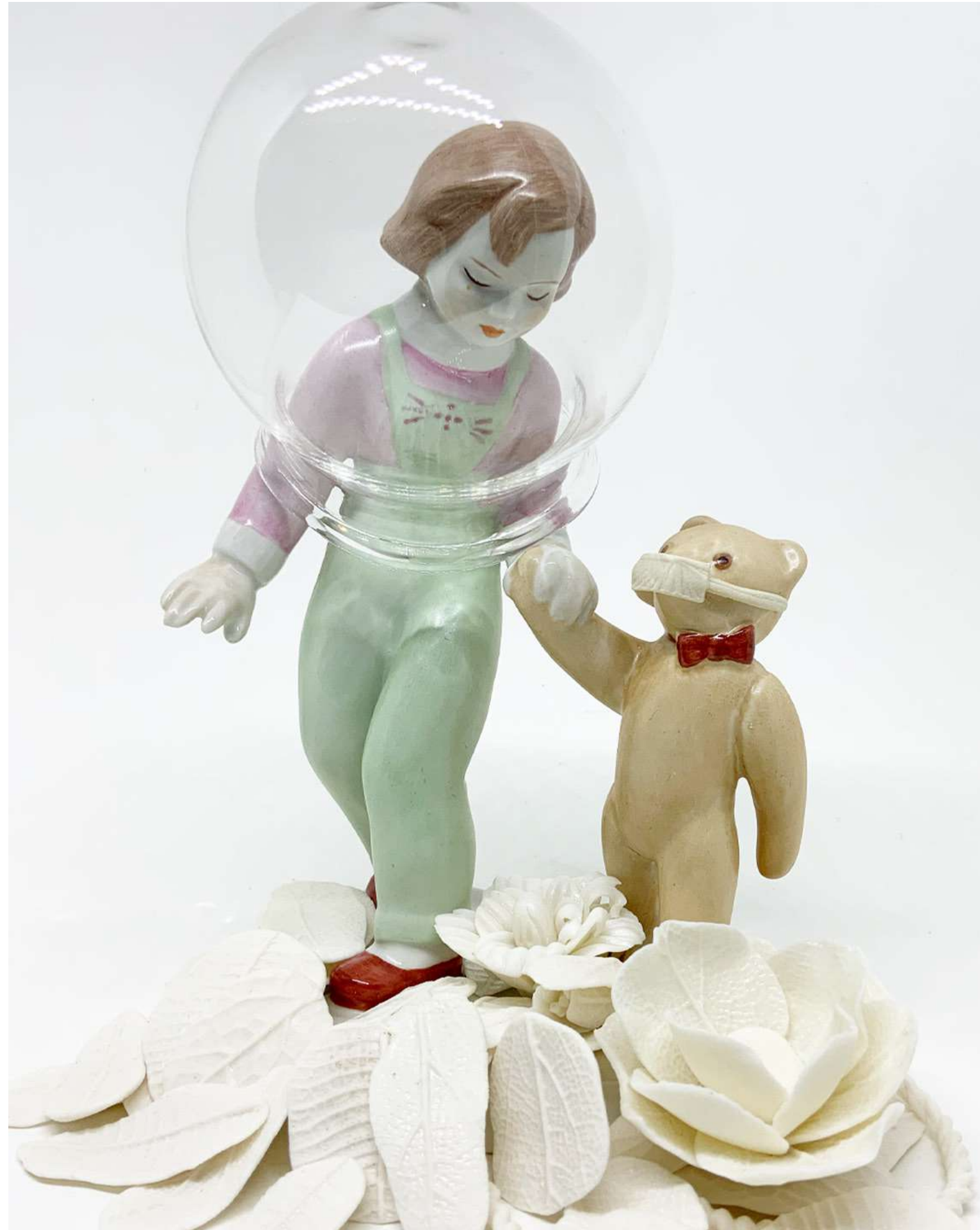
The Little Bear Porcelain, antique doll