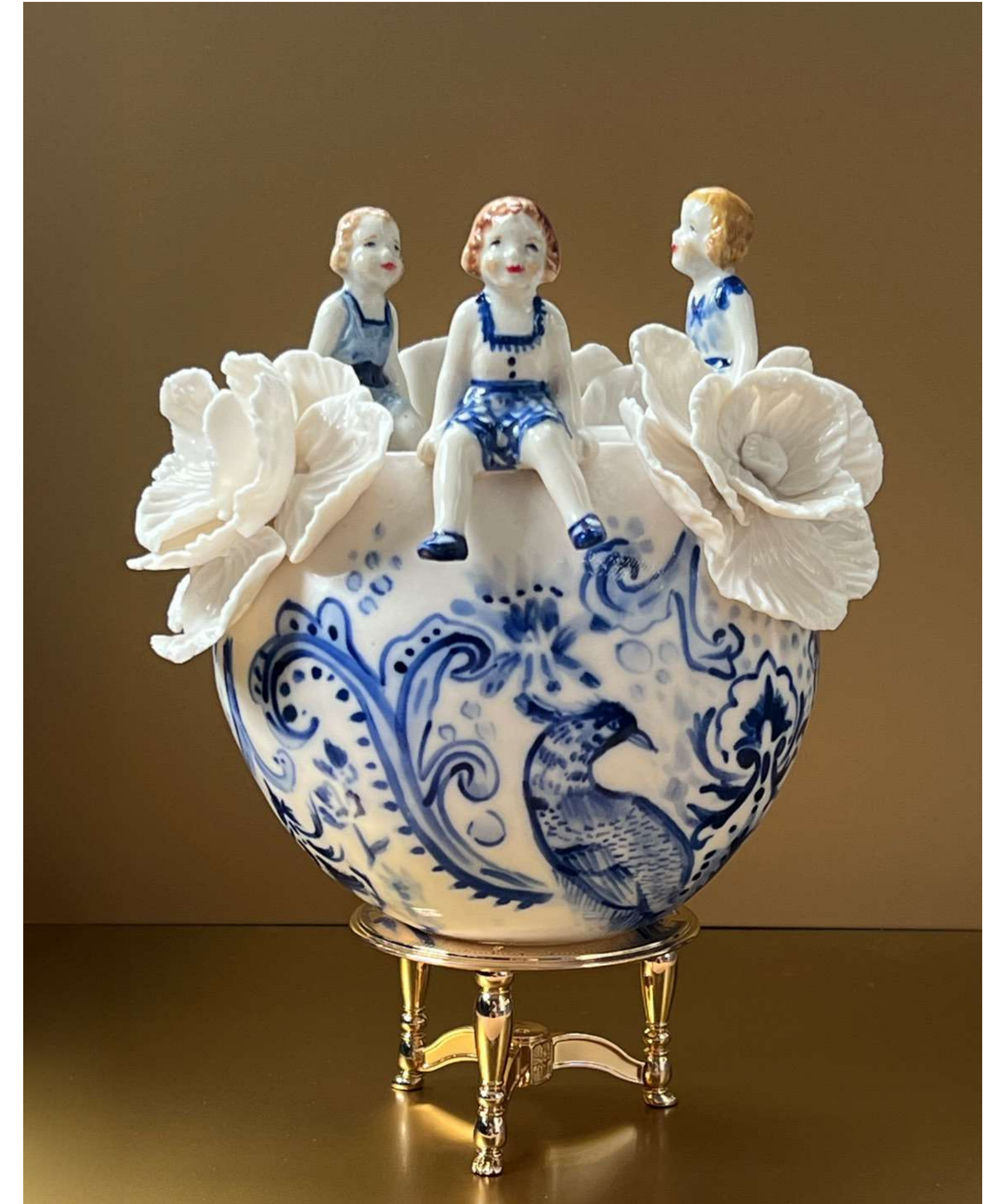
Les Triplettes Porcelain, brass, watercolour underglaze