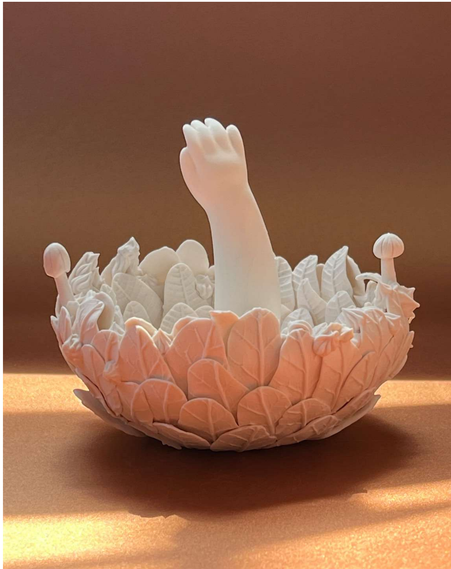
Nature Calling Porcelain