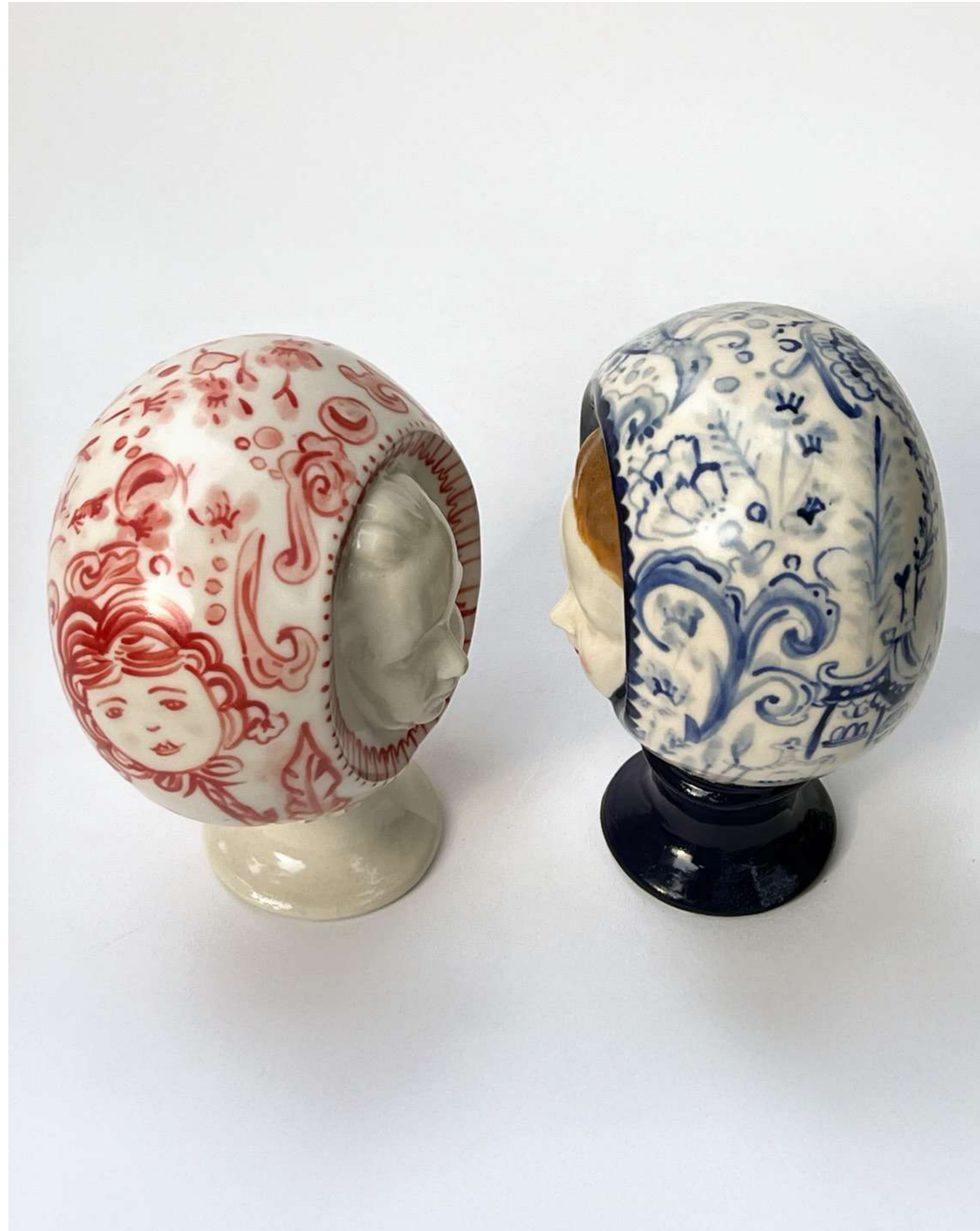
Le deuxième sexe Porcelain, watercolour underglaze