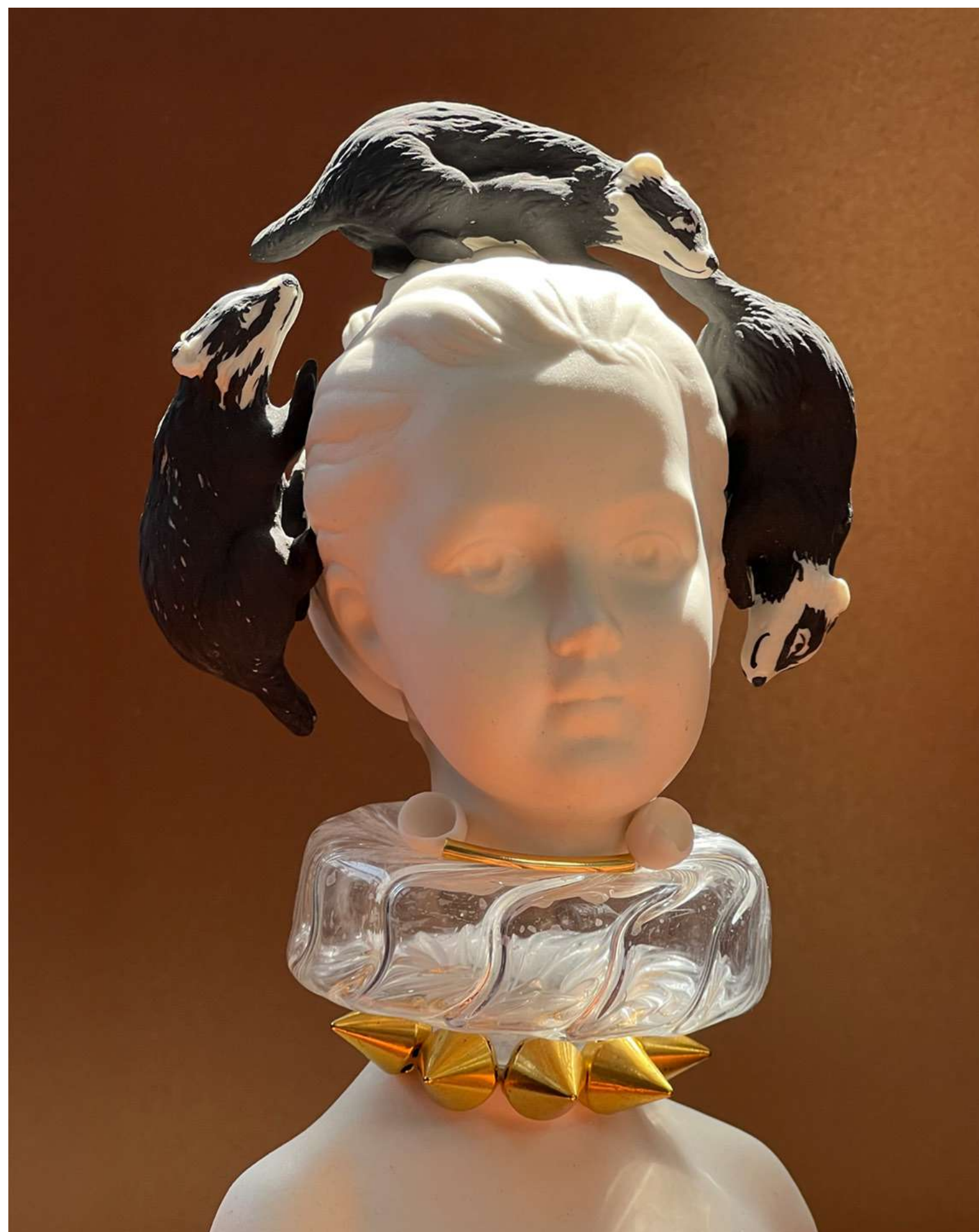
Badger Love Porcelain, glass, blowing brass