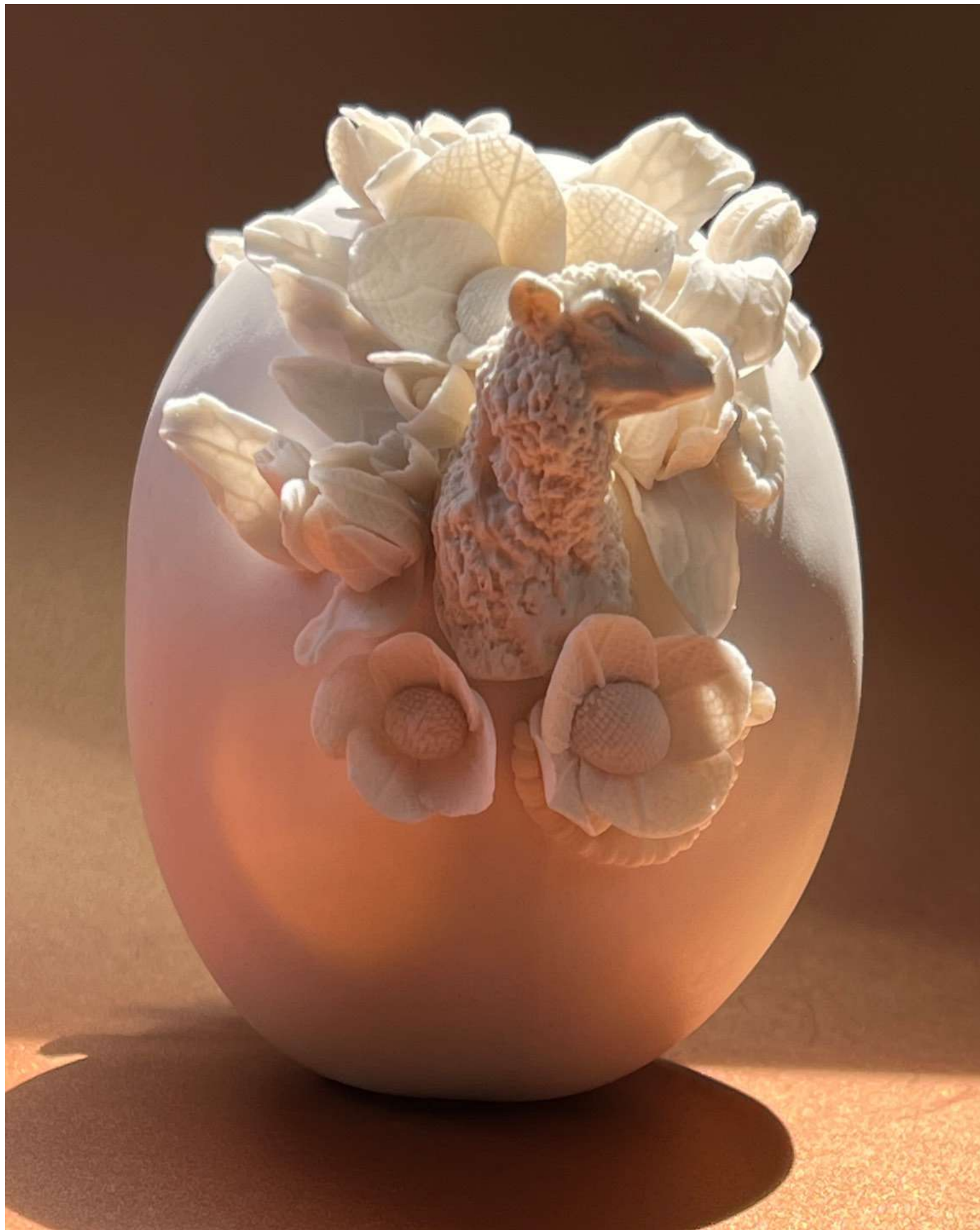
Resilience Porcelain, clear glaze