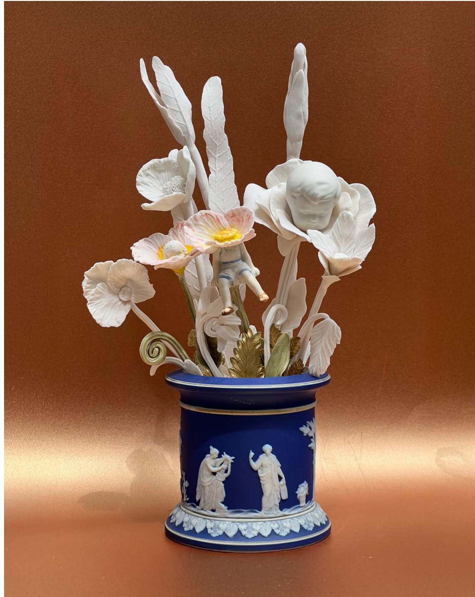
Playful Porcelain, watercolour underglaze, Wedgwood China