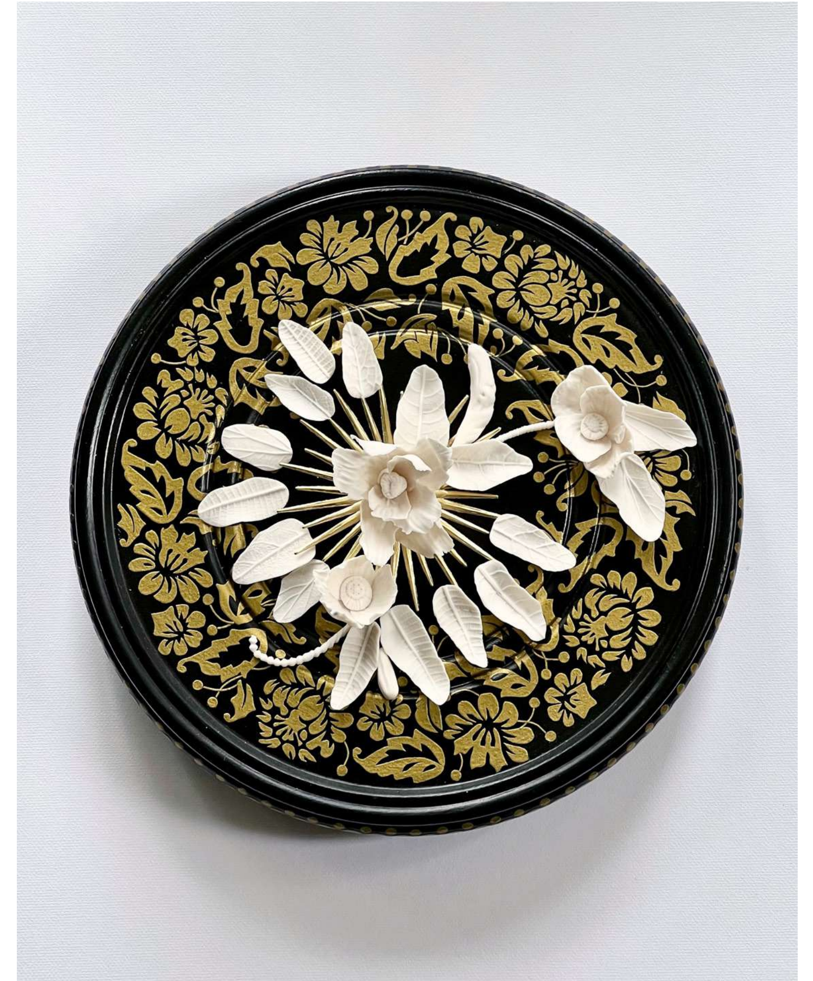
Mopa - Mopa Porcelain, wood, Pasto varnish