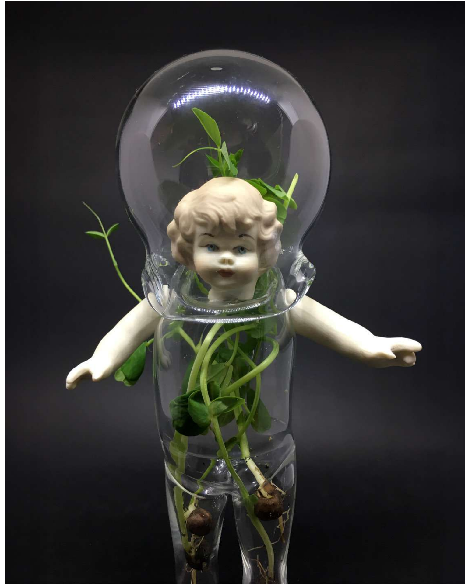
Golden Boy Porcelain, handblown glass