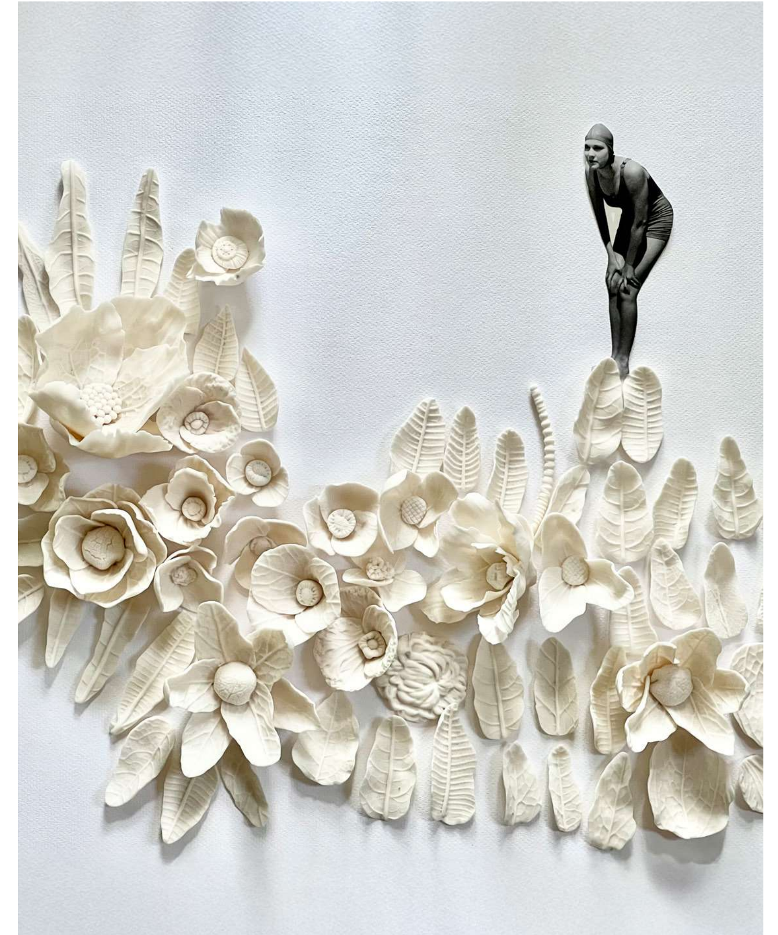
Arrecife Porcelain, paper