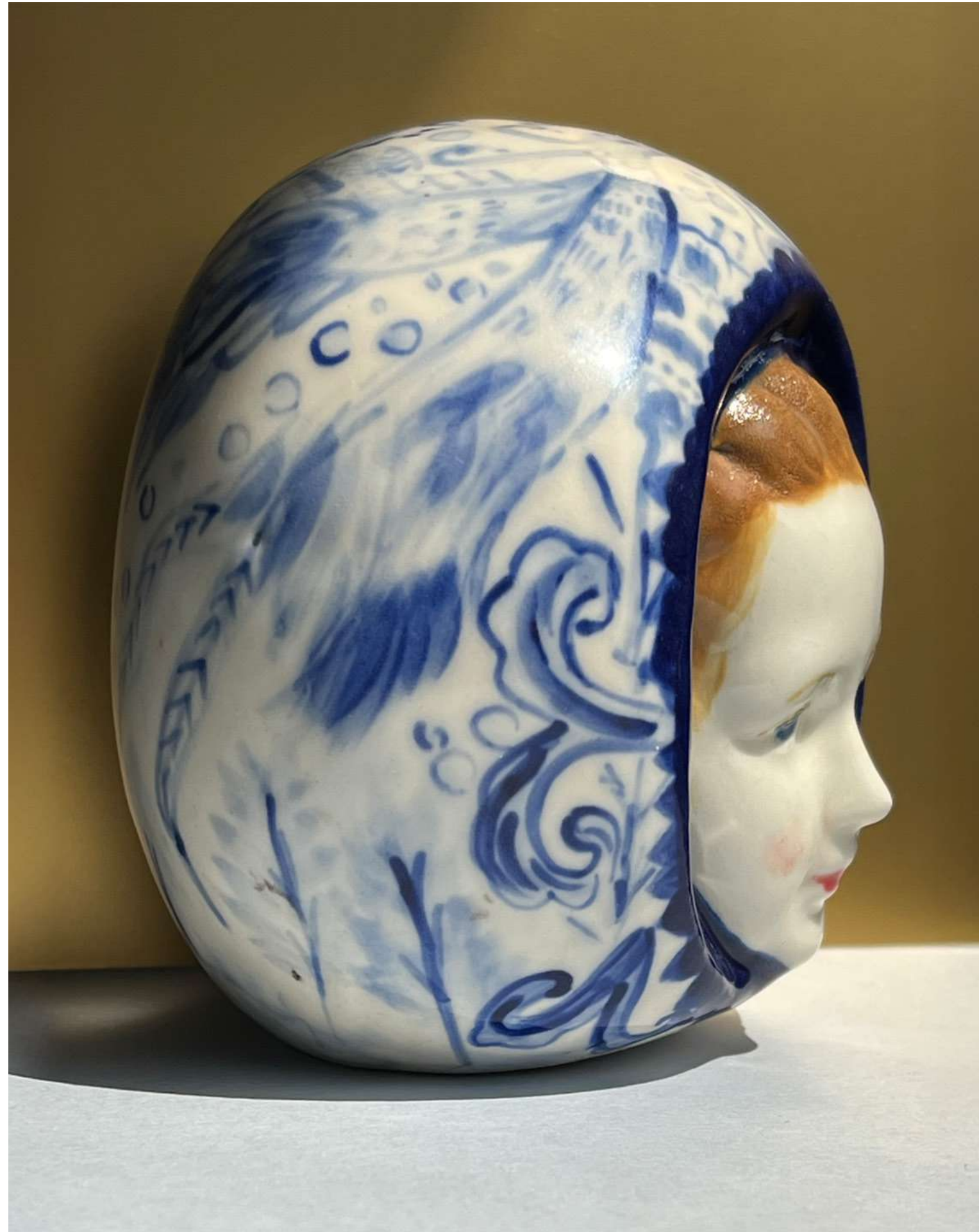
Le deuxième sexe Porcelain, underglaze, lustre