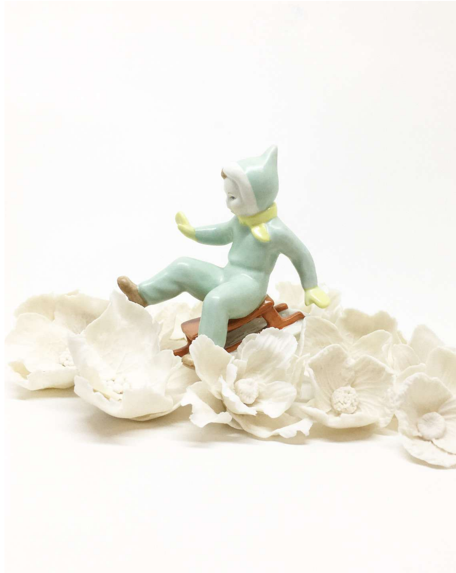
Inverno Porcelain, antique doll