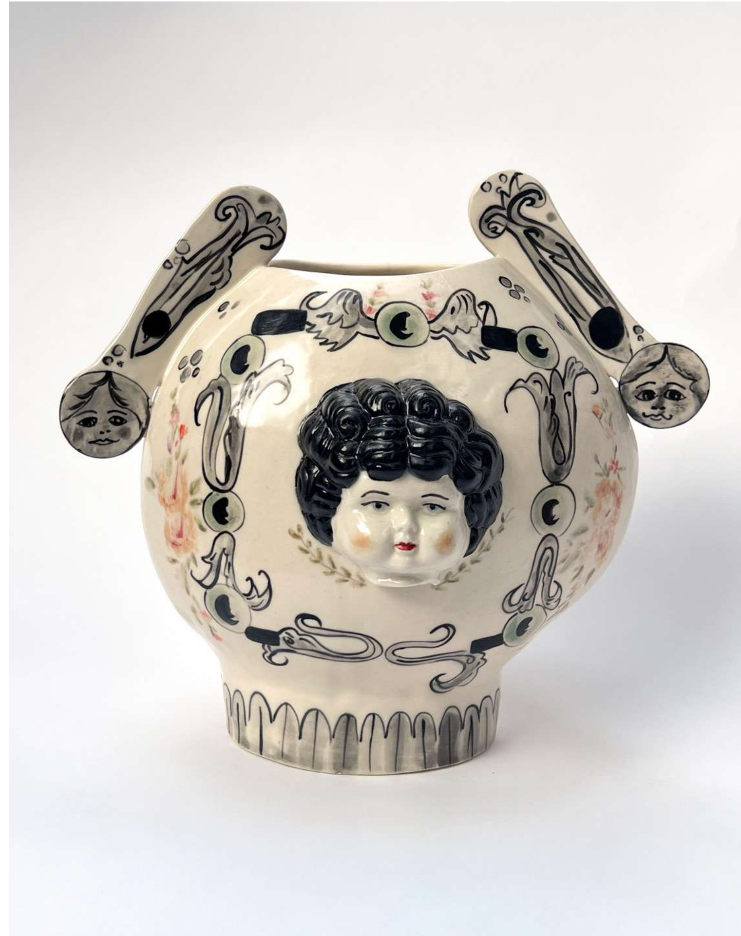
Bárbara Porcelain, watercolour underglaze, clear glaze