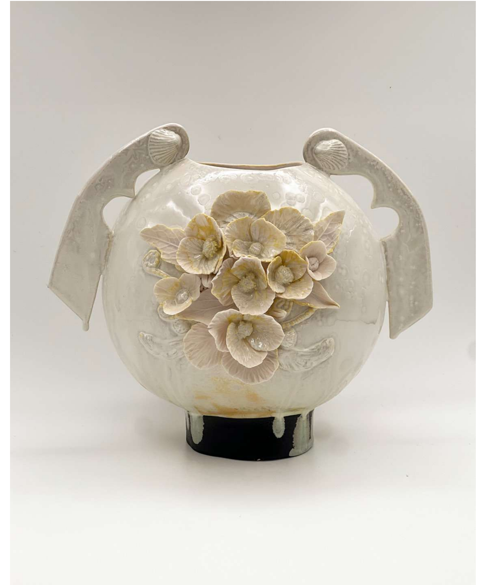
Resilience Porcelain, clear glaze