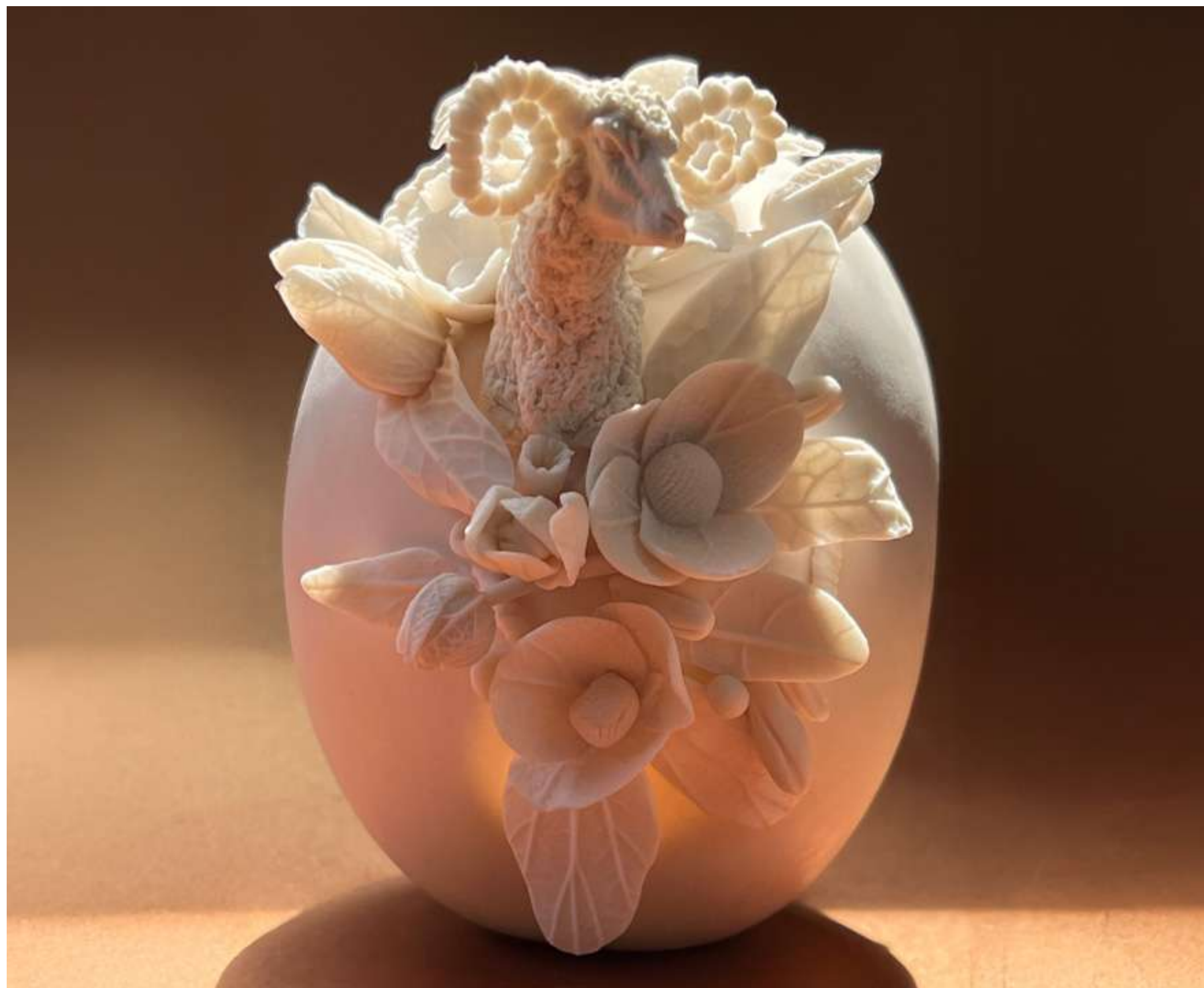
Resilience Porcelain, clear glaze